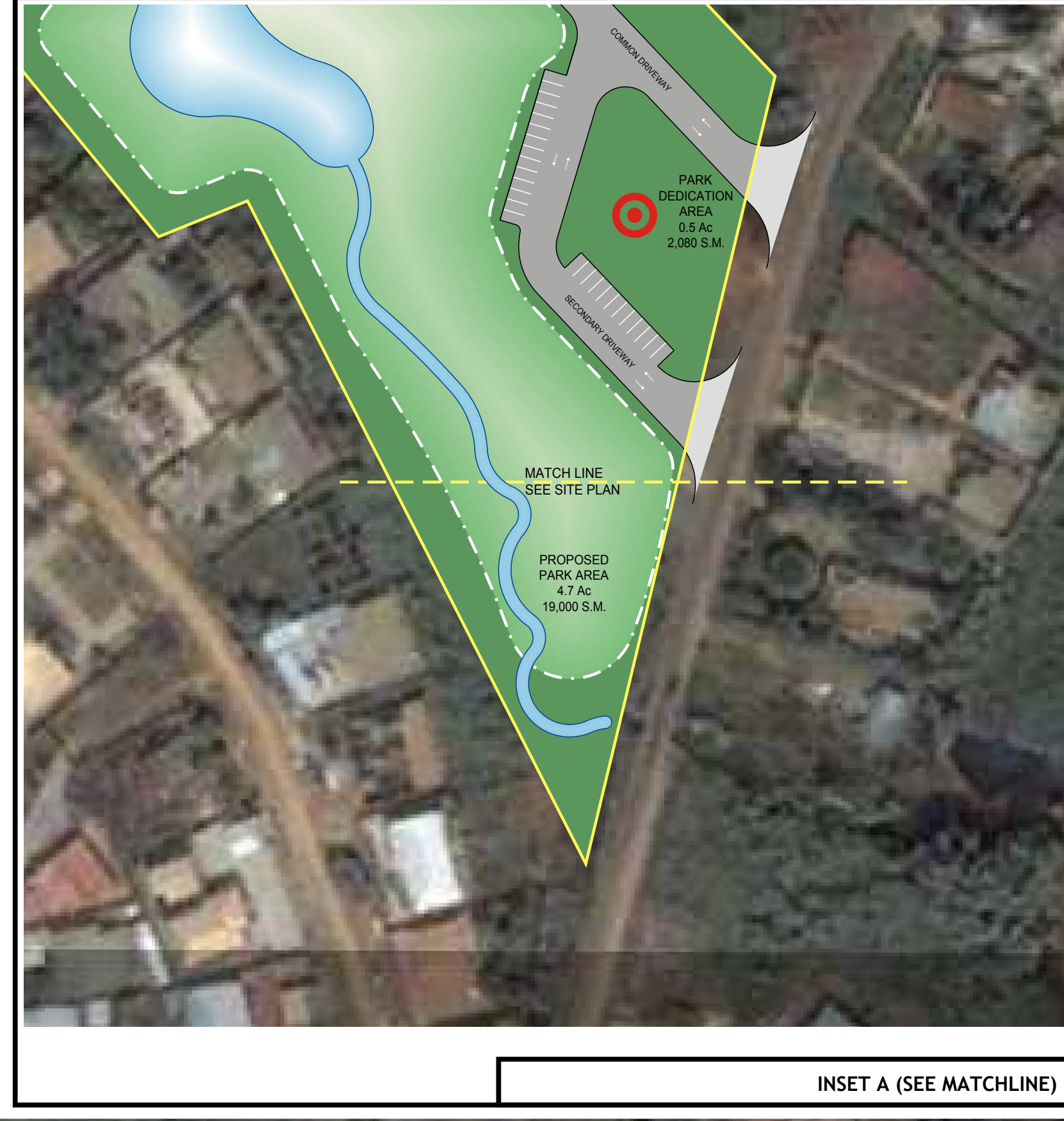
INSET A (SEE MATCHLINE)